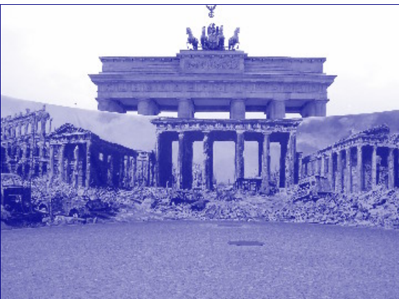
The Brandenburg Gate with images of WWII damage superimposed.

Now travelling to Berlin again from the East some 60 years later, my wife Diana and I took the train from Dresden through the eastern part of Germany (the misnamed former German Democratic Republic). As we had previously travelled into East Germany during the moribund days of the Cold War period, it was interesting now to notice the extensive construction and the renovation of buildings taking place in all of Berlin, but more noticeably in the eastern part.