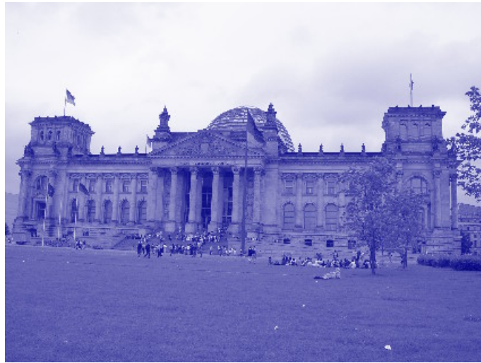
The recently renovated Reichstag – German Parliament building.