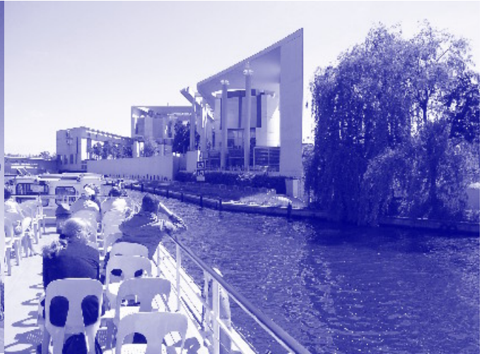
Riverside view near the Reichstag in former East Berlin.