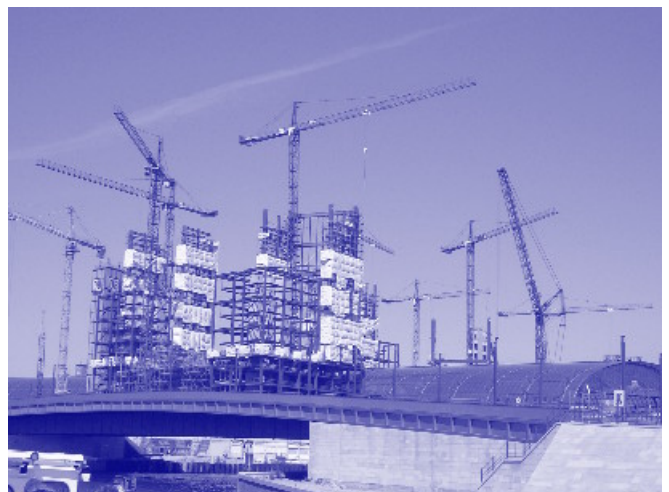
The giant new Berlin railway station under construction.