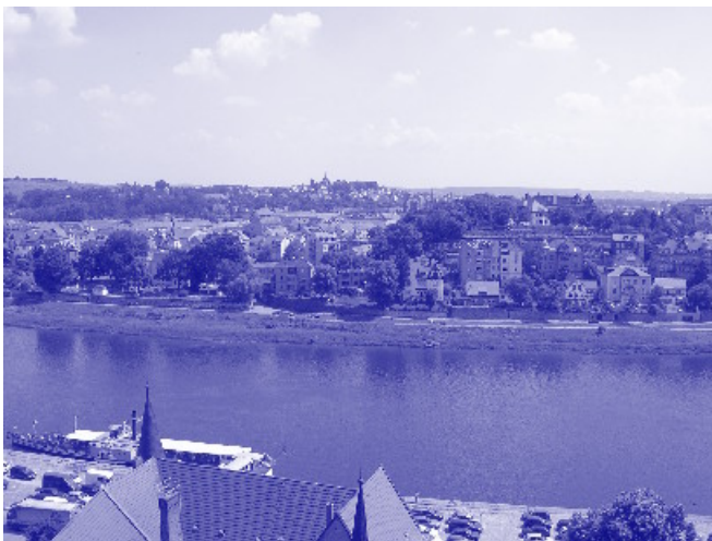
The River Elbe near Dresden, which city the author also visited.