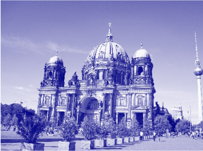
View of the Berliner Dom, a Protestant cathedral which is the resting place of Prussian nobility.