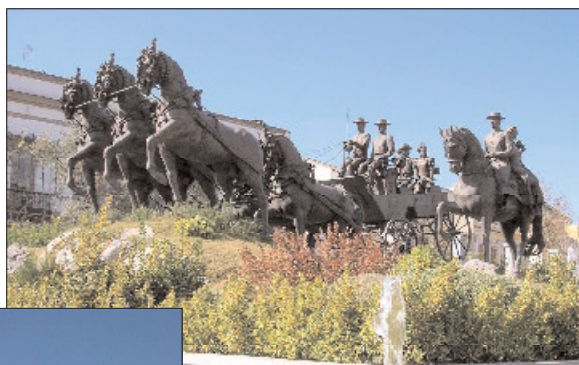
Statue at the Royal Andalucian School of Equestrian Art in Jerez.

Spain, like other nations, has experienced the despotic rule of man for all too many centuries and has had to pay dearly in the lives of its citizens. Until the monarchy was restored along with a democratic parliament after the death of Franco, Spain was too often an unfortunate example of unjust autocratic