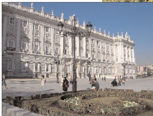
The Royal Palace in Madrid.

In the local museum we were introduced to a number of Phoenician artefacts , including a small stoneware 'weeping jug' which was used at a funeral to collect tears and then buried with the