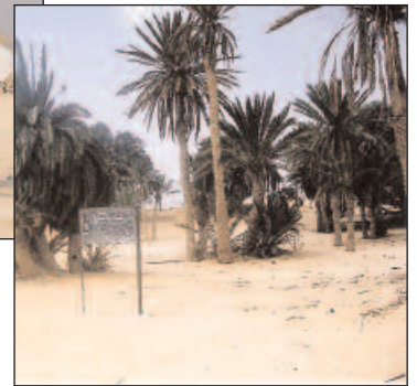
The 'Springs of Moses'

Whether or not this really was the correct location of the Mount Sinai