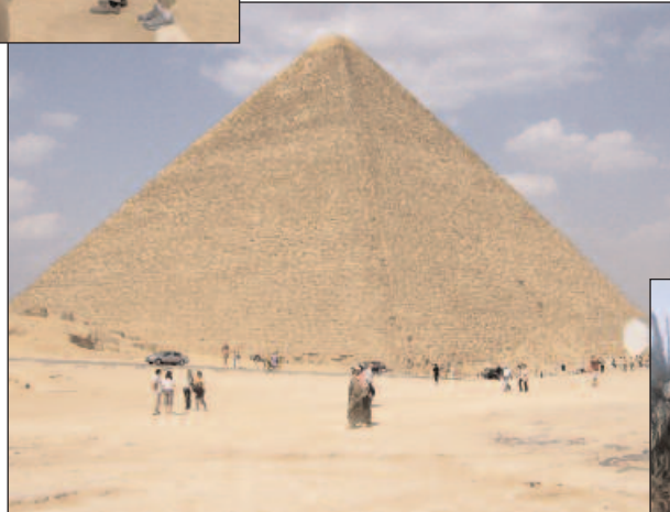
The great pyramid at Giza near Cairo stands 756 feet tall. It took 23 years to build it with an estimated 2.5 million blocks of stone. You would have to lay a block every five minutes to build it in 25 years.

stopped at the Springs of Moses (Exodus 15:27). Seven of the twelve springs still exist.