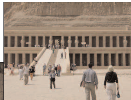
Hatshepsut's temple between the valley of the queens and the valley of the kings.

We started our tour in Luxor and the temple at Karnak. This vast complex