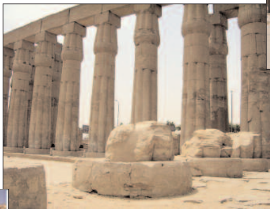
Above: Huge pillars of the temple at Luxor.

A minister prayed for and anointed me for the condition (see James 5:14). I considered this a trial and spent much time in prayer and Bible study. To be well enough to go on an expedition like this, after such an ordeal, was amazing.