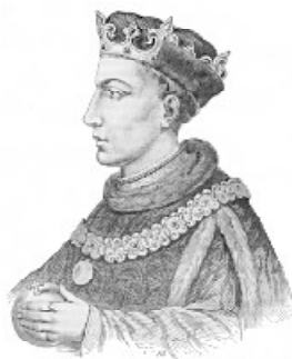
King Henry V

The king was to regularly read a copy of the Book of the Law. It is the very same source on which Queen Elizabeth II was asked to reflect during