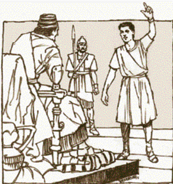
Through a dream, God revealed to Babylon's King Nebuchadnezzar that a series of kingdoms would arise. Daniel, God's prophet, revealed the meaning of the dream.

repeatedly demonstrated, is that neither national leaders nor their people are able consistently to obey God on their own. Paul summed it up when he wrote: "What then? Are we [Jews] better than they [gentiles]? Not at all. For we have previously charged both Jews and Greeks [gentiles] that they are all under sin. As it is written: 'There is none righteous, no, not one; there is none who understands; there is none who seeks after God. They have all turned aside; they have together become unprofitable; there is none who does good, no, not one'" (Romans 3:9-12).