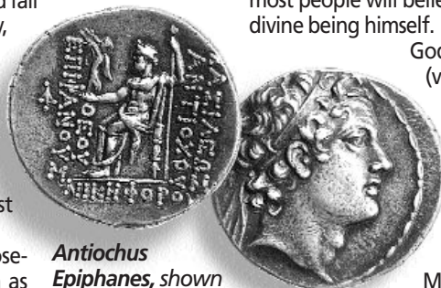
Antiochus Epiphanes , shown here on a silver coin of his reign, outlawed many of the Jews' religious practices and desecrated the Jerusalem temple by sacrificing swine on the altar.

Be sure to request your free copy of Are We Living in the End Time? for additional understanding of Bible prophecy.