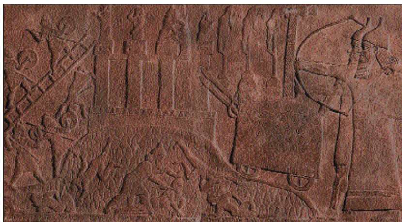
God repeatedly warned Israel and Judah of national punishments if they continued to rebel against Him. As God had prophesied, both kingdoms were taken into captivity. At left, King Sargon of Assyria, conqueror of Israel, receives a report from Tartan, his commander in chief. The Assyrians commemorated their conquests, like the capture of the city above, in exquisite carved stone reliefs.