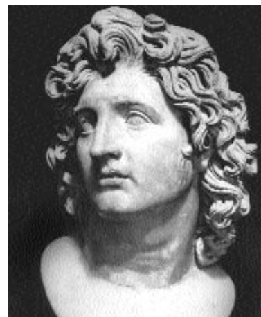
The rise of the empire of Alexander the Great was prophesied by Daniel well before Alexander rose to conquer most of the known world.

Daniel 8 is a detailed prophecy of the first “abomination of